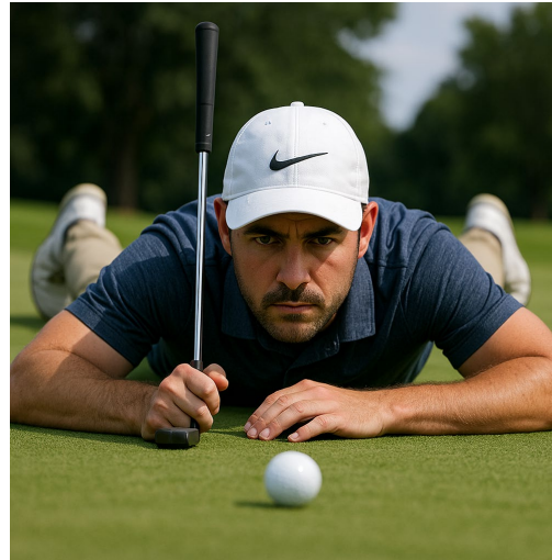
designed to assist golfers in reading greens.

We are currently seeking introductions to potential sponsors or industry partners who may want early involvement. The goal is to fund the development of a